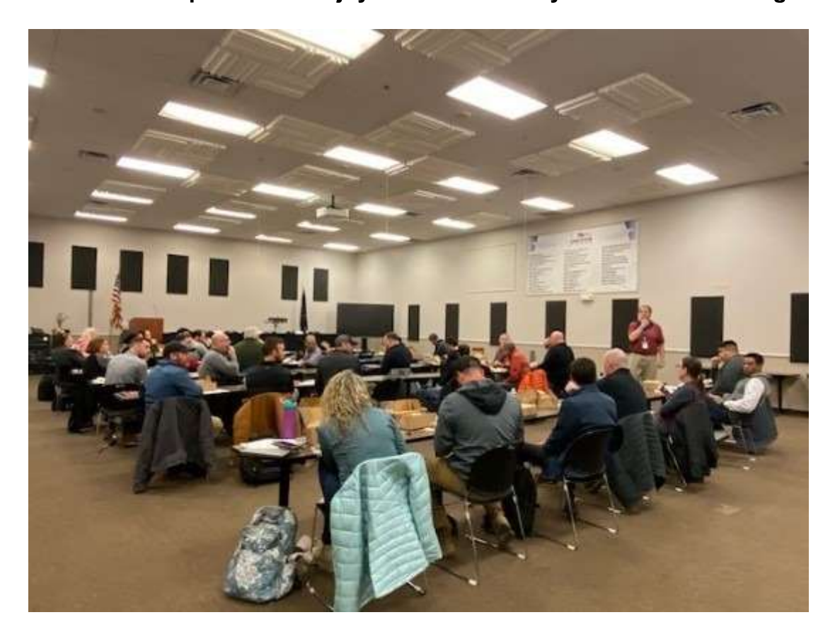
Contractor Pre-Qualification Roundtable hosted by ABC of Indiana